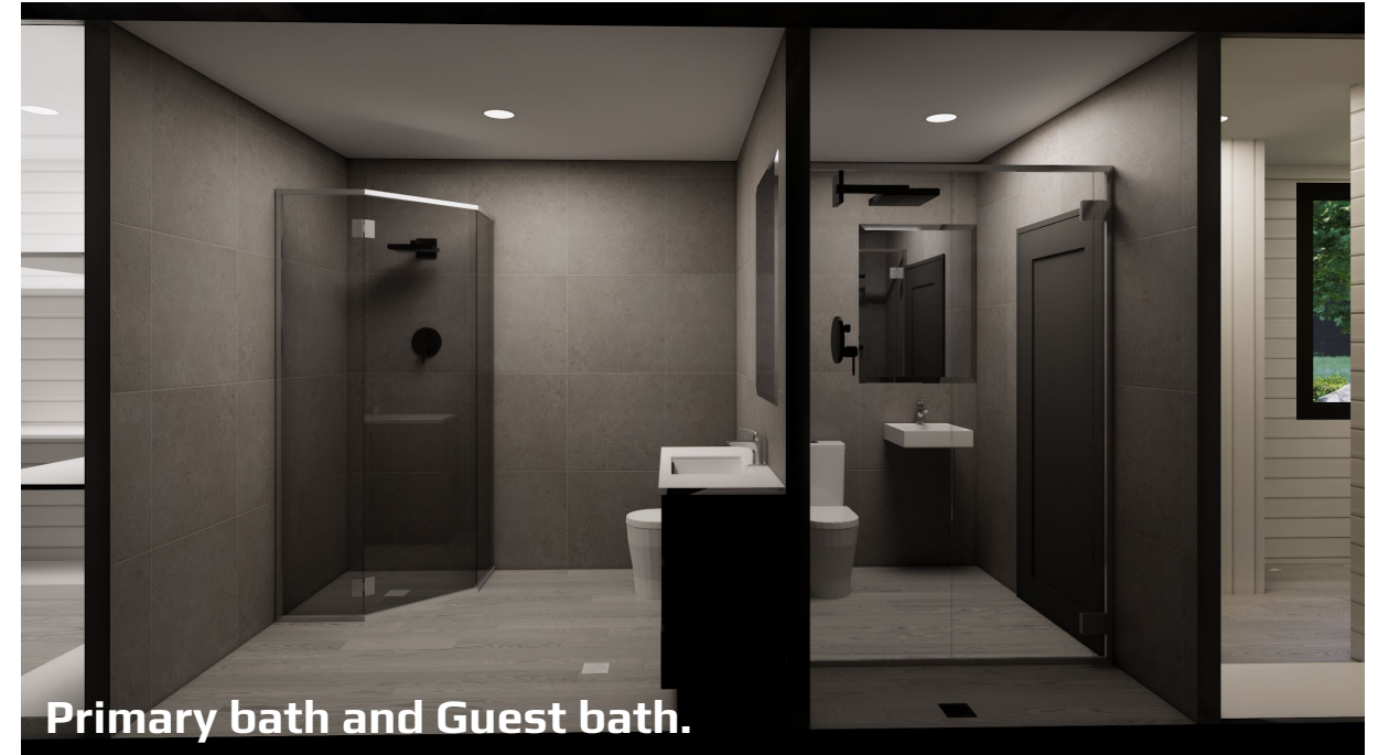
Primary bath and Guest bath.

Built for everyday living. Intentional layouts, durable materials, and modern touches create a space that moves easily and feels right from the start.